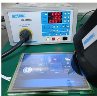
3.1 静电放电测试图 Electrostatic discharge test

Test process: the product was placed on the test bench to perform contact and air discharge in turn of the serial screen iron frame and display area as shown in Fig.3.1 below. During the experimental process, it was observed whether the screen is dead, black, white, splash, or reboot. According to the experiment results, the performance is in line with the criteria GB/T 17626.2 B level and above.