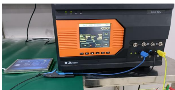
3.2 群脉冲测试图 EFT test

Test process: the product was placed on the test bench to perform contact and the smart screen is energized by the power supply coupled with a EFT generator as shown in Fig. 3.2 below. During the experimental process, it was observed whether abnormal reset, display or touch phenomena occurs. According to the experiment results, the performance is in line with the criteria GB/T 17626.4 B level and above.