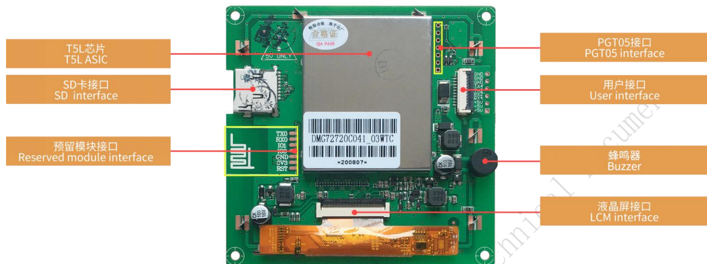
硬件接口图 Hardware interface