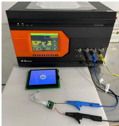
3.2 群脉冲测试图 EFT test